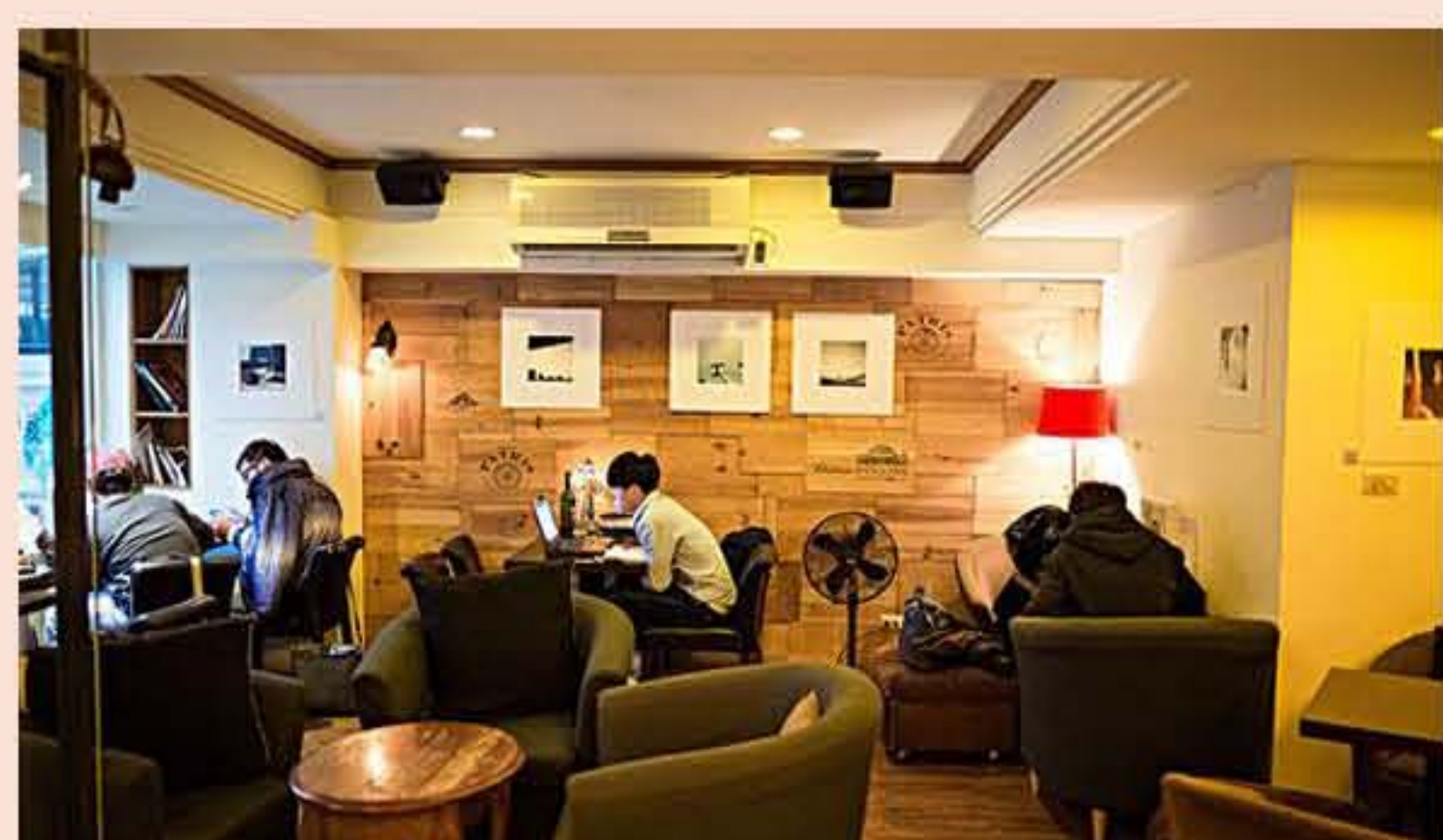
Coffee shop/ Training courses