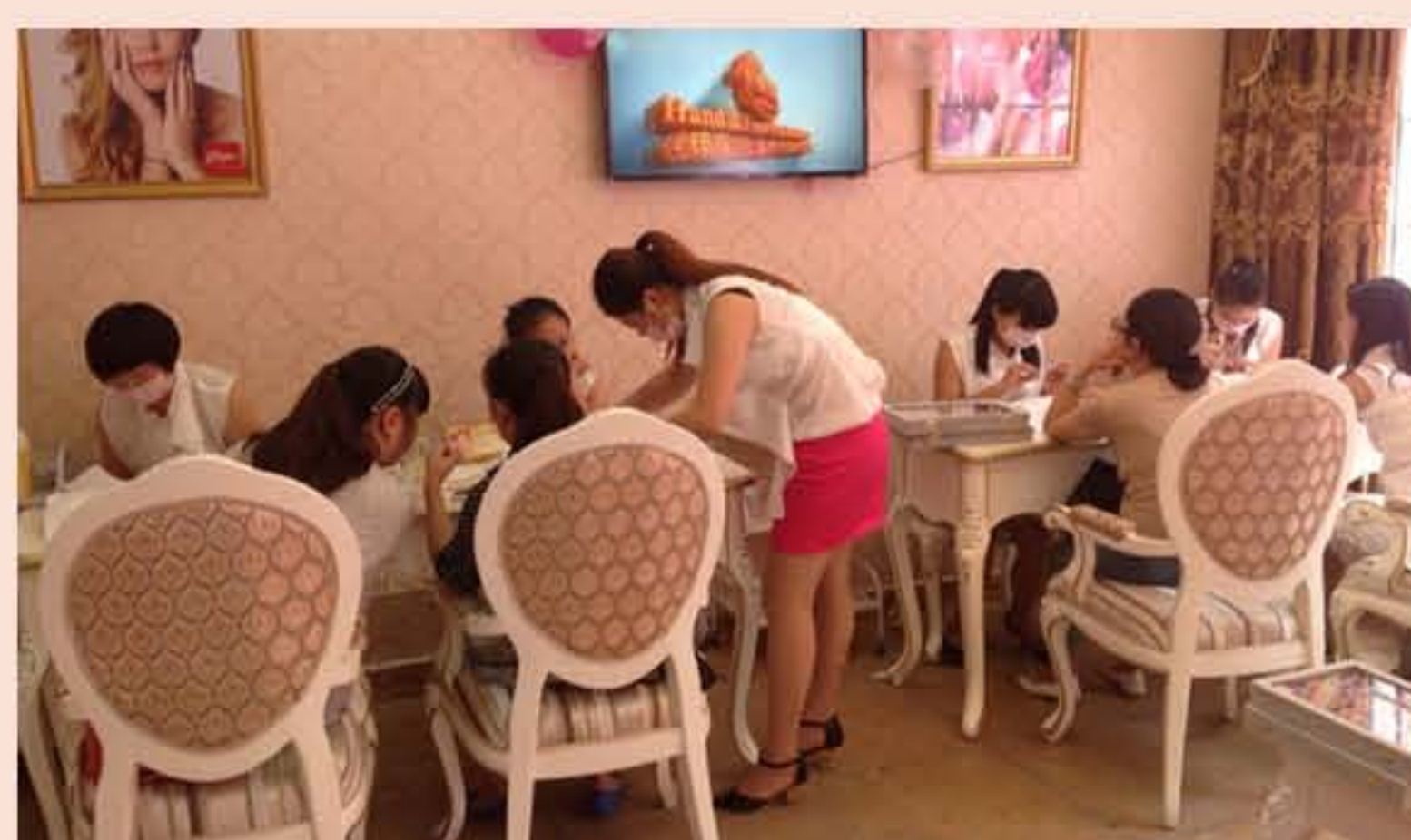
Nail salon/Beauty shop